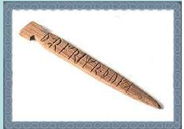
Wood tag identifying property, reading "Thorgrim's pile"

They were also used by merchants to keep records of items bought and sold.